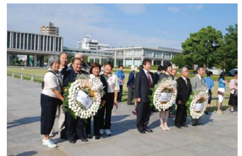
Memorial Wreaths presented.