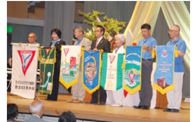
Convention opening shows all banners ... District ... and all clubs in district. So, how cum we don't do this at ours???

We did enjoy the time we had with the Y's Men in Hiroshima. Besides meeting them individually, we shared two gatherings with them: the Sunday luncheon during their Domestic Brother Club and International Brother Club get-together and dinner to celebrate the