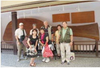
Check out the rice paddy on Miyajima Island.